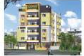
Suma Splendour, Hyderabad