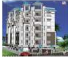
Divya Splendour, Nellore