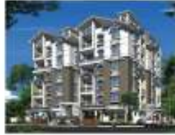
Sahitha Abode, Secunderabad