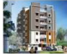
Vinayaka Abode, Secunderabad