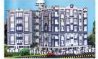
M.B's De Royale, Secunderabad