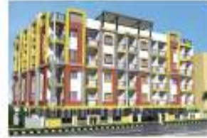
Radiant Castle, Bangalore